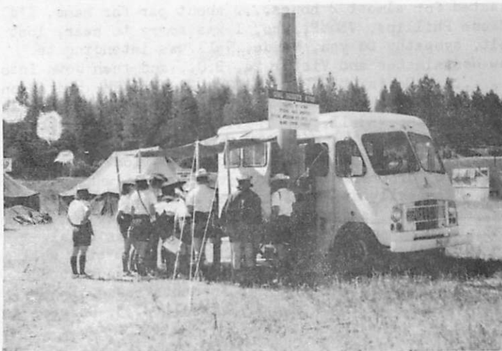
Scouts signing the register while listening to ham radio