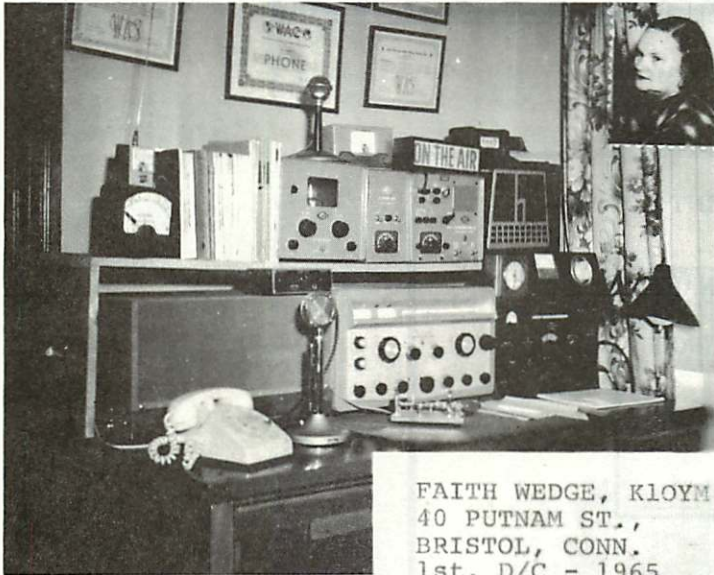
FAITH WEDGE, K1OYM 40 PUTNAM ST., BRISTOL, CONN. 1st. D/C - 1965