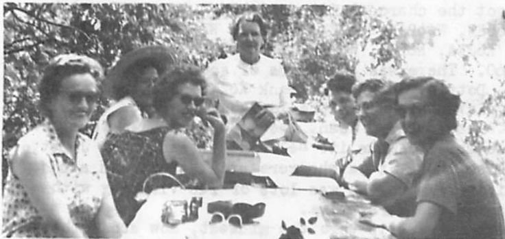
Hamfest in Glacier Park. L to R--K7GWA, K7OZY, K7DCI, W7TGG, W7QYA, W7ZJZ, W7DJU.