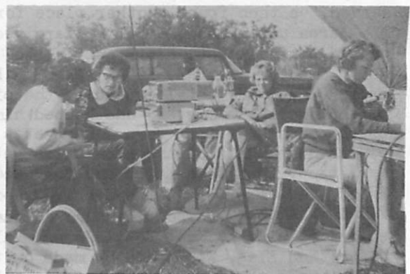
Portland Roses 1st Field Day