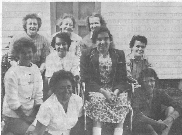
Back row-KLIIF, K1OKC, K1SLS Middle Row-K1OLM, K1KTJ, K1GSF, K1EKO Bottom Row-W1ZEN, K1IZT