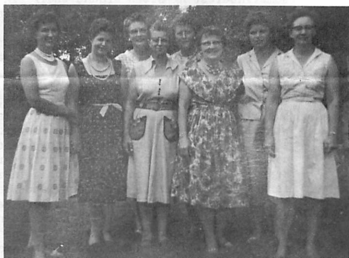
Buckeye Belles - Findlay Hamfest, 9/9/62

L to R-K8MCD; W8CTK; K8ITF; K8MZT. Trailer headquarters of K8MZT.