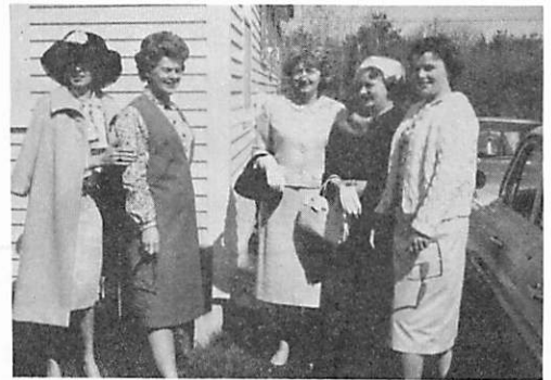
Headed for Portland, Me. and the WRONE Luncheon were K1IZT, K1LCI, K1IIF. W1ZEN + K1EKO - none of whom could see with their sunglasses off that day!!!