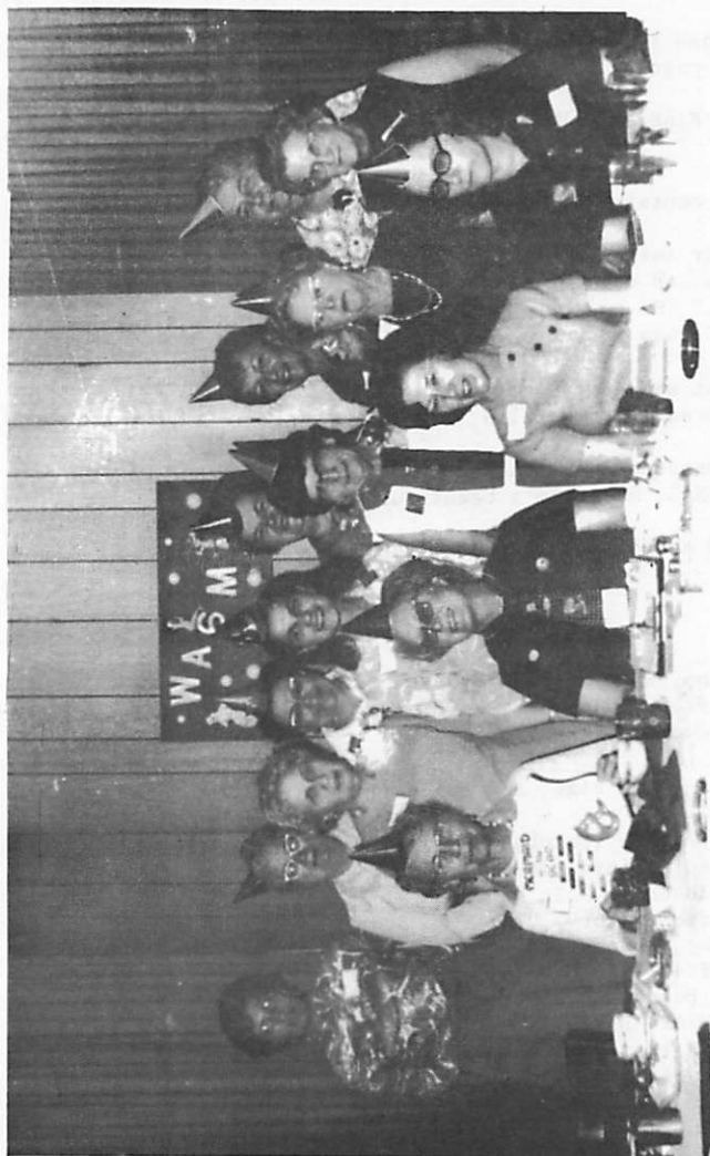
BAYLARC mermaids assembled beneath the club's call sign at their 18th birthday celebration, October 1972.