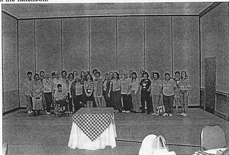
YL Luncheon - Colorado HAMCON 2003

There were even five OMs there to support us and we got a great picture of all the YLs at the luncheon.