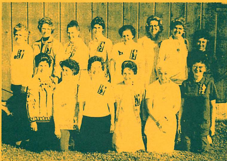
Fall M I N O W picnic