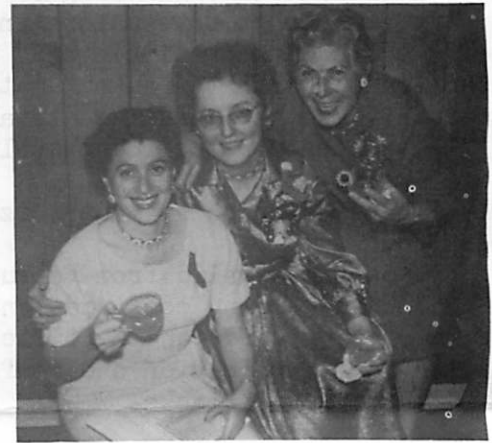
LAYLRC Xmas Party. K6KCI, W6QYL, K6JZA.