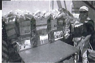
The YLRL Display