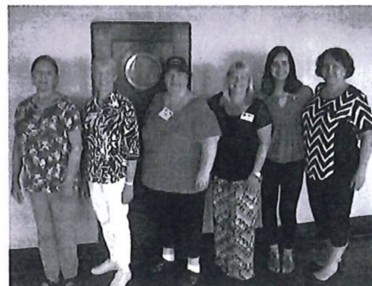
Ladies on the Queen Mary

Our group was honored to have exclusive use of this prestigious broadcasting platform. We were not rushed and transmitted on all the transceivers while responding to a large pile up of stations trying to reach us from points all over the world. It happens to be next to the large fog horn which still goes off at 9am, 12 noon, 3pm and 6pm every day. The horn can be heard all around Long Beach Harbor. While out at sea the sound travels up to 100 miles. The ladies had a startling experience when the 3pm blast went off during their QSO's. We thought the noise was coming from one of the radios, or maybe we touched the wrong button!