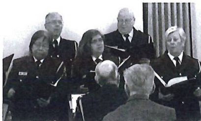
The Police Choir