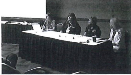
The YL Forum Panel!