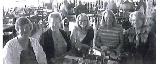
left to right: KC0WYK (T); AH6OS (A); NE0DB (E); KE0LWN (T); W9BPP (T) - going for General

The St Louis and Suburban Radio Club, in St Louis Missouri, is proud to announce Winterfest, January 27, 2018 from 8:00 am - 1:00 pm. As one of the mid-west's largest amateur radio hamfest, Winterfest has over 230 tables, 85 different vendors and more than 800 patrons.