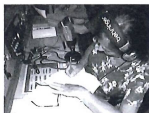
Operating from the Wireless Room