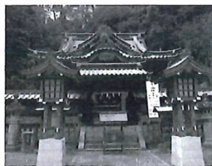
Shizuoka City Temples

http://kyoto-hanatsubaki.coin/setsugekka_en/