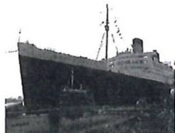
The Queen Mary

We had a wonderful time aboard the W6R0 Queen Mary. Our ladies traveled from multiple locations in the western U/S to the Queen Mary in Southern CA. We arrived the day before and had time to tour the historical ship. There are many interesting tours, displays, gift shops, restaurants and views from the vessel. Those of us from out of town stayed on board in the hotel for two days.