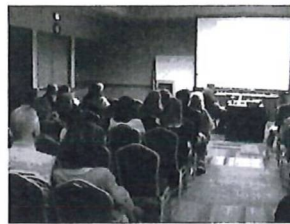
YLS and Allies at the forum

The program was followed by a lively question and answer session with the audience, most of whom signed up and availed themselves of YLRL promotional materials. Many attendees complimented us during the remainder of the convention on how they enjoyed the YL Forum and how they wished it had more time allotted.