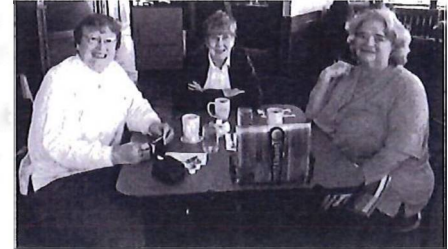
Coffee in Fairbanks!