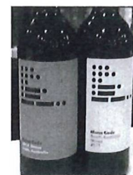
Morse Code Wine!

"We even found some Morse Code wine in the bar at the hotel. Fancy that!"