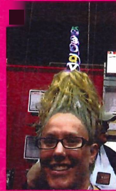
FriedrieKsTiafari 2013 jnca+ing YL