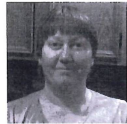
District Three News de Cecilia Bastone, KB3VEN