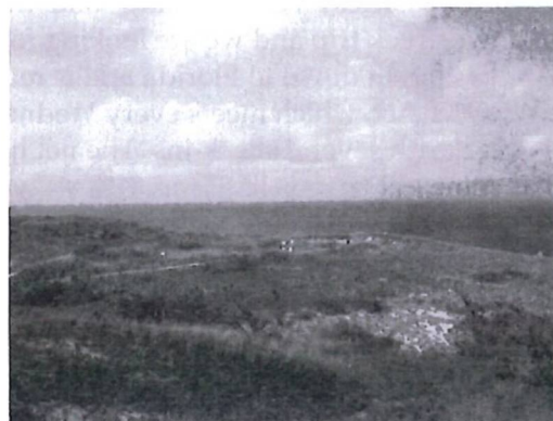
The Marconi Site under change.