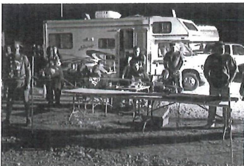
Stage 13 in Action!

to keep the skills fresh: "Participating in Events show that the amateur radio community is still a valuable communication resource capable of setting up operations just about anywhere we are needed."