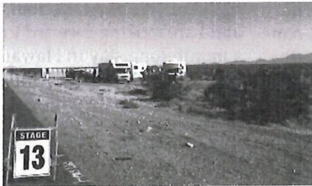
Stage 13 early on