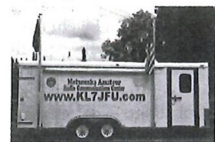
New Communications Center

MARA also just acquired a new amateur communications center to use at different events they have in the club. They were able to show it for the first time at the Mat-Su Emergency Fair in Sept. What a great addition to your club!! I'm sure it's going to get a lot of use!