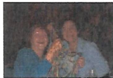
The Young Ladies Radio League has members from all over the world. Many of them belong to their own local organization as well such as these members of ALARA. Sponsor a DX-YL in YLRL and she just may return the favor with her country's organization.