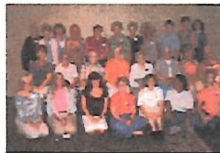
2011 YLRL Convention was held near Boston, MA with members from all over the world attending.

Every three years, the YLRL holds their international convention. Meet other members from around the world. Enjoy speakers on a multitude of ham radio topics. Speak up at the YLRL forum. Learn what other YLs are doing in amateur radio.