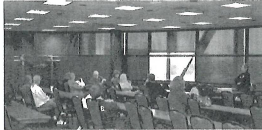
The YL Forum

The forum I held had a good turnout, the subject of which was "What was the most interesting contact you ever had, be it 2 meters or low band". We had some very interesting stories from all the YLs. I always make sure everyone talks, even OMs, if they are brave enough to penetrate our bastion and we had four this year, counting my very own OM, AI - WB9SSE.