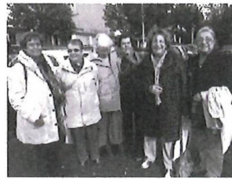
Some of the YLRL members in Kassel,

In Kassel they all boarded a bus and went to a very old town with blockhouses situated between river Weser and Fulda. It was a cold rainy day so they ended it with hot tea and rum. In the evening we had our YL-meeting talking about YL schedules and nets.