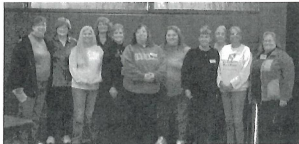
YLs at the Hamfest