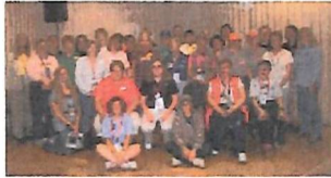
The YL Forum is held every year and is very popular.

Every year at the Dayton Hamvention, the YLRL shares a booth with the Buckeye Belles. Here YLs from all over the world meet face-to-face and catch up on the latest. The YLRL also has a forum at Dayton every year. Check the Hamvention guide for speakers, time and location of the YLRL forum.