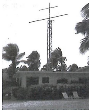
Hani Shack in Aruba