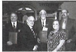
2011 Awards Winners Group

The BARA Babes have been busy on the air with their weekly nets on two meters. The word is out that the BARA OM's have challenged the BABES to skeet shooting challenge. This should be very interesting! I'll let you know how this all turns out!