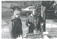
The N3ZEL Memorial Picnic