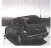
AB6YL Outside Mobile rig

District 6 News Continued to the left of the car's radio (not visible in the photo.)