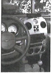
AB6YL Mobile rig

"Here is another picture that I took at the ARRL Southwest