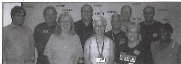
First Annual K6HTN CW Class