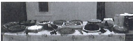
WACOM Christmas party and Dessert table