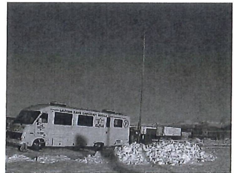
The CCV beam