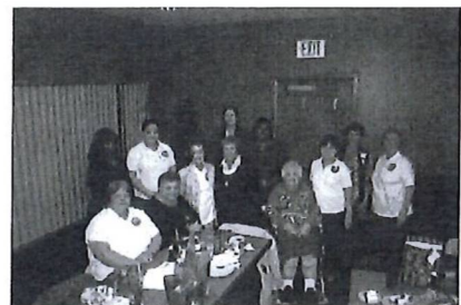
The SMYLs wish everyone a Happy New Year

The new SMYL officers were announced during our Christmas Dinner.