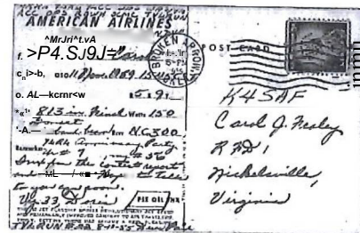
QSL card from K4BNQ in 1959

It's good that all three of us are still participating in ham radio and members of YLRL. I hope all of you have long "careers" in amateur radio and YLRL. Keep up that continuous membership each year.