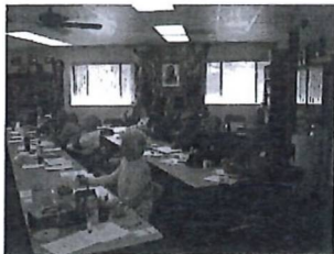
Note the YLs in the crowd of the Techfest!

Trying to talk with YLs across the country has got me thinking a lot more about antennas. To that end, I made a very nice day trip into the mountains and attended a day long "Techfest" one of the area's radio clubs, the 285 TechConnect Radio Club put on. ("285" refers to US Highway 285, which runs into the mountains west of Denver and south through Santa Fe, New Mexico.)