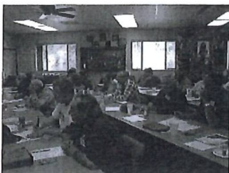
YL Harmonics November/December 2008

For nearly 6 hours I learned more about antennas. Some was definitely useful; including reminders about just how much signal is lost between radio and transmission from the antenna (and fortunately what can be gained by a decent antenna). Some was interesting but useless (to me) stuff about huge antenna towers (covenant restrictions).