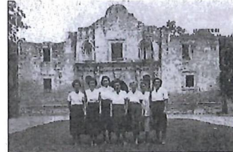
K5YCE-K5TSE - W5WXT - K5OPV - W5KQG - K5OPS - K5OPT

received this card. I think I remember Inez telling me she became a ham in October of 1952.