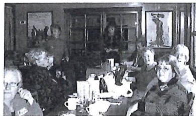
The WRONE Meeting

The WRONE luncheon on the first Saturday of November allowed many of us to get together at O'Connor's Restaurant in West Boylston, MA to chat and eat as well as conduct a business meeting. Attendance was good, although we would love to welcome more YL's and their spouses or friends to this twice-yearly gathering.