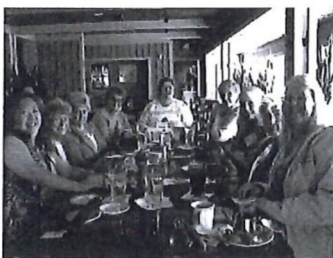
Two Rivers YL fall get together

The net is on Wednesday evenings at 8:30 p.m. on the 147.24 repeater (+ offset and no tone), the Clark County Amateur Radio Club 2 meter repeater. It is reasonably informal and there is a get-together about 3 times a year. There are about 28 YLs now who have checked into the net or are interested in meeting other YLs in the area.