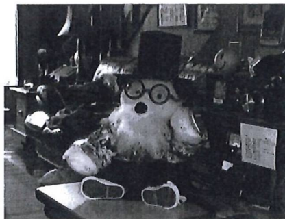
Two of the wonderful centerpieces!

Our Ham Convention planning committee has also agreed that our table decorations that are going to be used during the Saturday night banquet dinner will be put up for silent auction. The proceeds from the silent auction sale of our Radio Polar Bear centerpieces will be donated to the YLRL scholarship! Be there so you can take home one of these great polar teddy bears for your Hamshack and home station. [They are adorable. I wish I could bid!-Ed.]