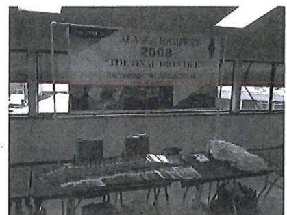
Promoting our Alaska Convention at the Mie & Key Flea Market, Seattle Washington; March 8, 2008.