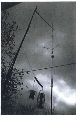
How to thwart the squirrels and help the birds!

Greetings to everyone from District 10! We are happy to note that spring is underway; the trees are trying to bloom and the trees are trying to leaf out. We found a new use for antenna poles: holding bird feeders for our early arrivals and the birds