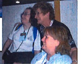
A number of YLs helped take care of the booth.