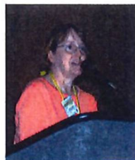
The YLRL Forum was full.