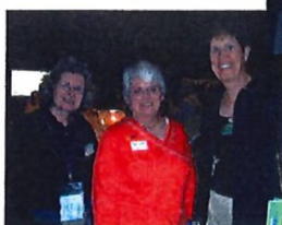
There were YLs from all over the world!