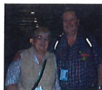
A Few OMs stopped by as well