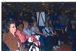
There were quite a few YLs at the ARRL YL mini-forum, too!