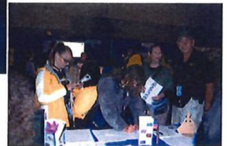
Even more stopped by to say "Hi!"