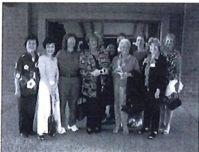
At the YLRL Conventin in Denver, Colorado.

Since I last wrote, we did go to Denver for the YLRL convention. We had an absolutely wonderful time, seeing old friends and making new ones, and seeing the sights in and around Denver. I loved the Molly Brown House, the Celestial Seasonings tea tour, but my favorite was the Leaning' Tree Western Museum. I didn't hold out much hope for it because Western art is not my thing, but was I ever surprised. I saw the most amazing paintings I have ever seen. I would love to go back and spend a week just there.