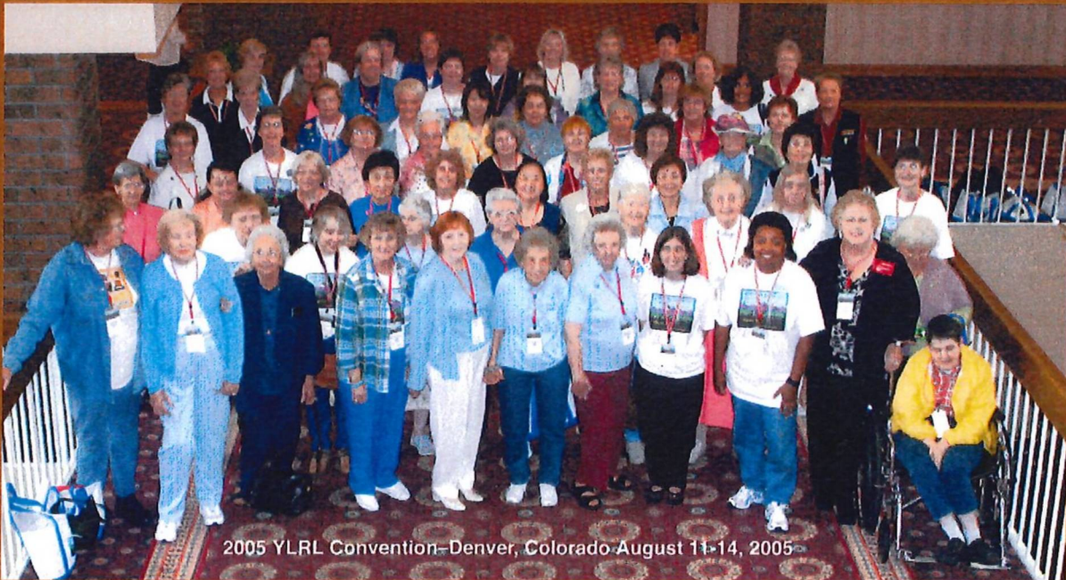
2005 YLRL Convention—Denver, Colorado August 11-14, 2005