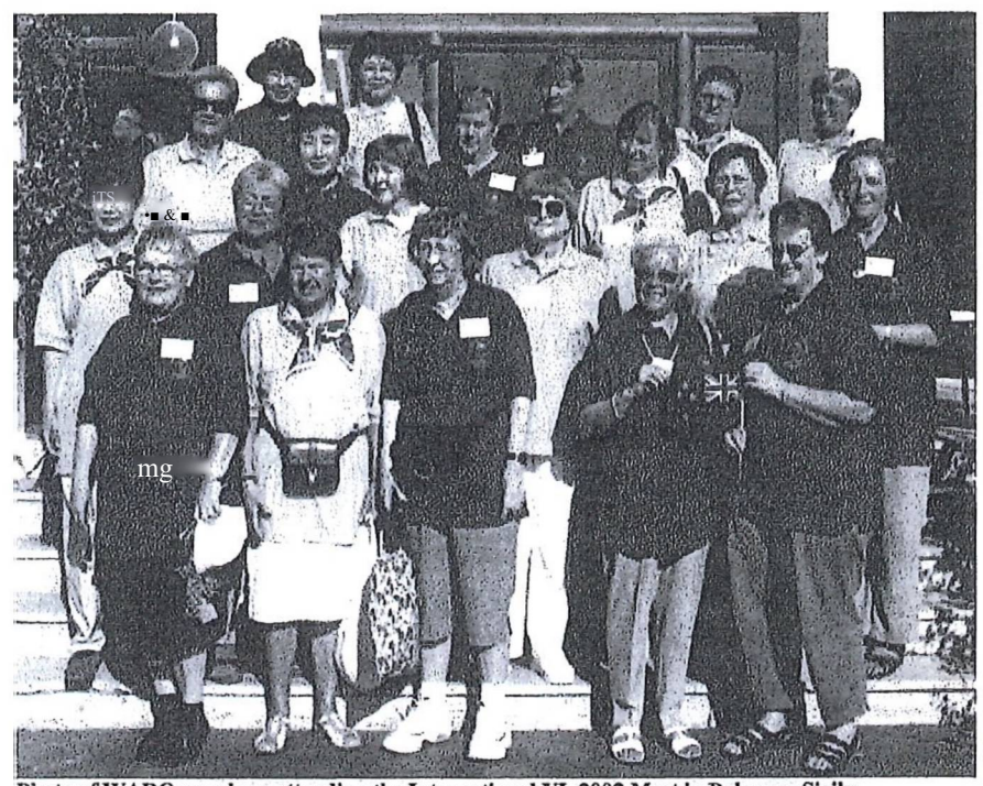
Photo of WARO members attending the International YL 2002 Meet in Palermo, Sicily.