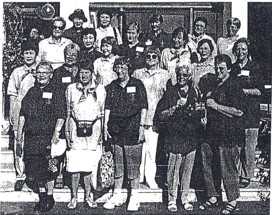
Photo of WARO members attending the International YL 2002 Meet in Palermo, Sicily.