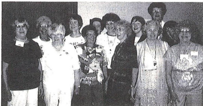
■ Buckeye Belles at the YLRL Convention: Front: K9RXK, W9RTH; K6INK, KJ8X, WA2NFY, W8WRJ. Back: KOEPE, KK5L, K4LMB, WD8IKC, WAOWOF, WD8DQG, and K18V.