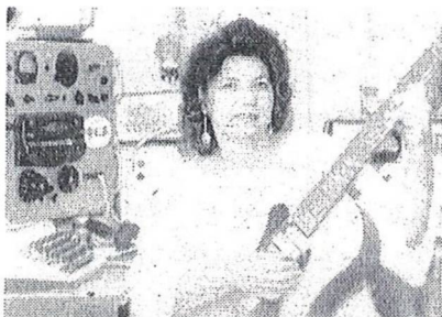
9du(ti-ta(ented Mda-'UASWfM She composes, pIays SWfp sings!