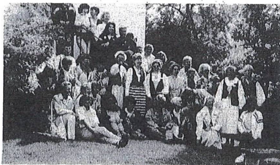
A gathering of YLs at YL-91, Stockholm