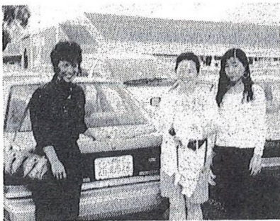
Sharon-X&GVC^ Qdasafco-J 210Cyf. Reiko, fJdasafep's daughter