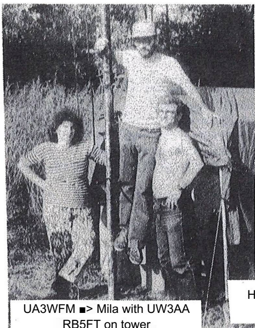
UA3WFM ■> Mila with UW3AA RB5FT on tower Team of DX-pedition 4K5ZI