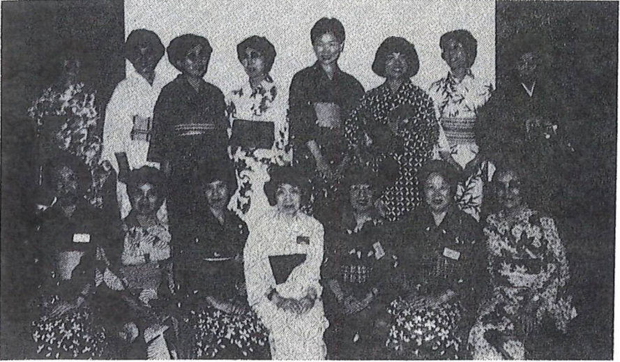
JAPANESE YLS IN THEIR BEAUTIFUL KIMONOS AT THE CONVENTION IN HAWAII