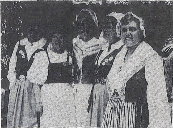
SWEDISH YLS IN THEIR COSTUMES AT THE YLRL CONVENTION IN HAWAII