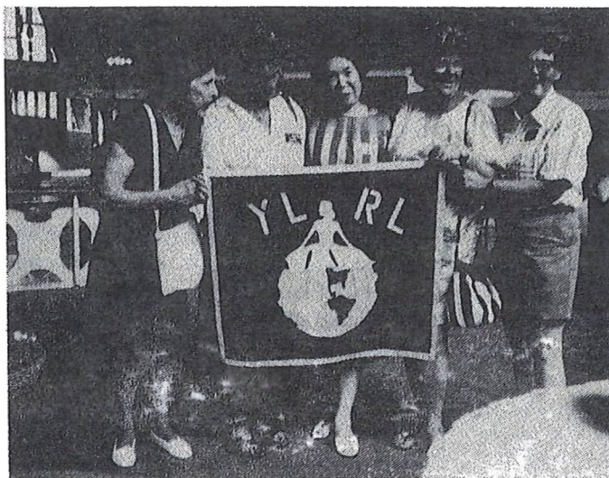
KALMB, DJ1TE, JH3SQN, WAIUVJ & NI*17N