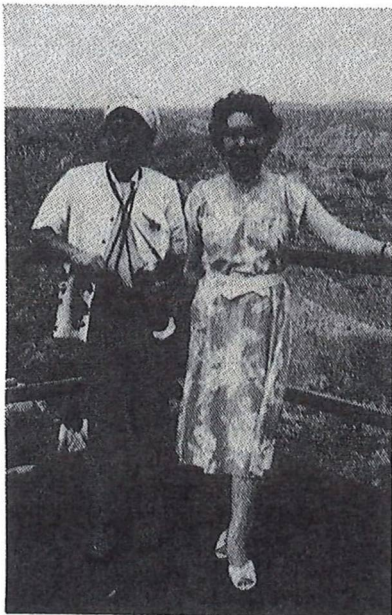
JH3SQM, OM OF NOZOMI, JH3SQN

Please write Sylvia with news of your radio activities. The November/December issue will be her last as your D/C.