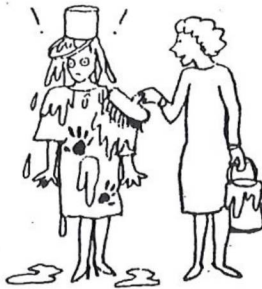
- doesn't take too long either