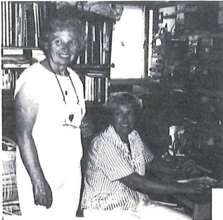
I7J1ADY and 7J1ACN operating at JA1ABQ . Fumi's shack in Tokyo